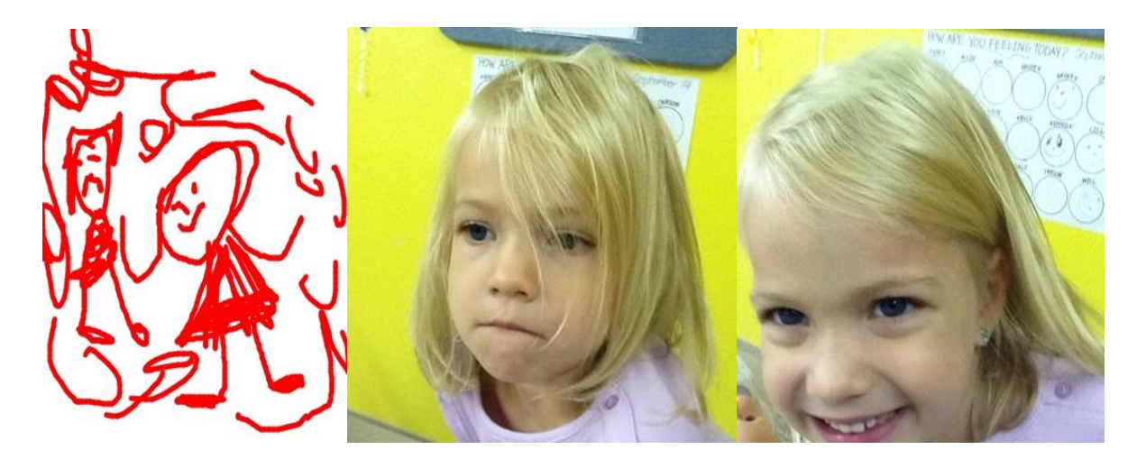
Figure 2. Student sample from Feelings Book